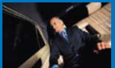
UV protective films